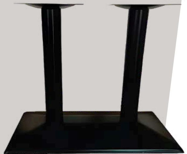
PC Rectangle Table Base : 8000/- Height : 720mm