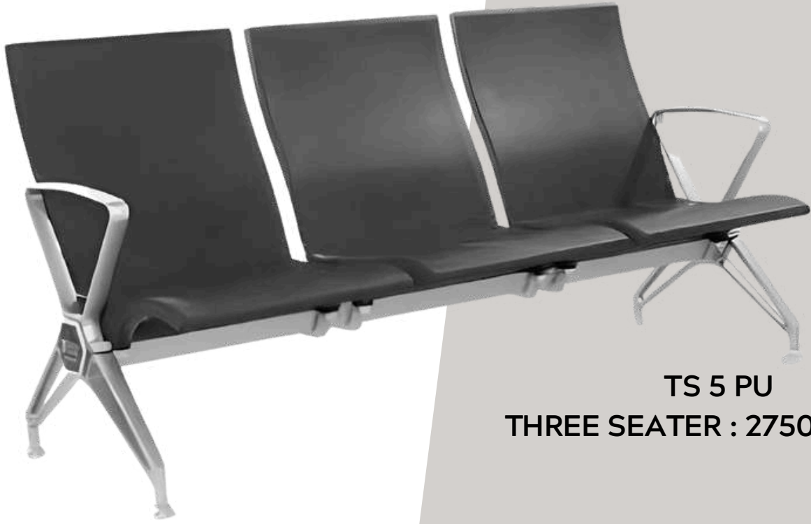
TS 5 PU THREE SEATER : 27500/-