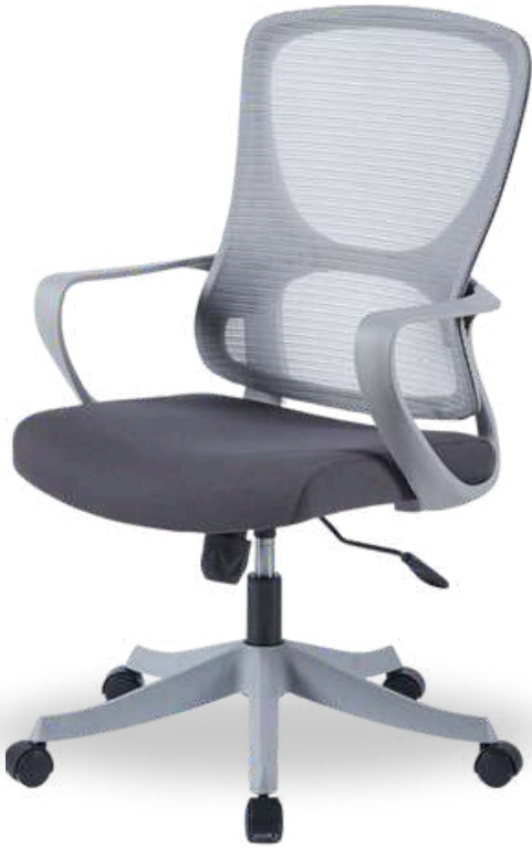
M32 GREY : 7150/-