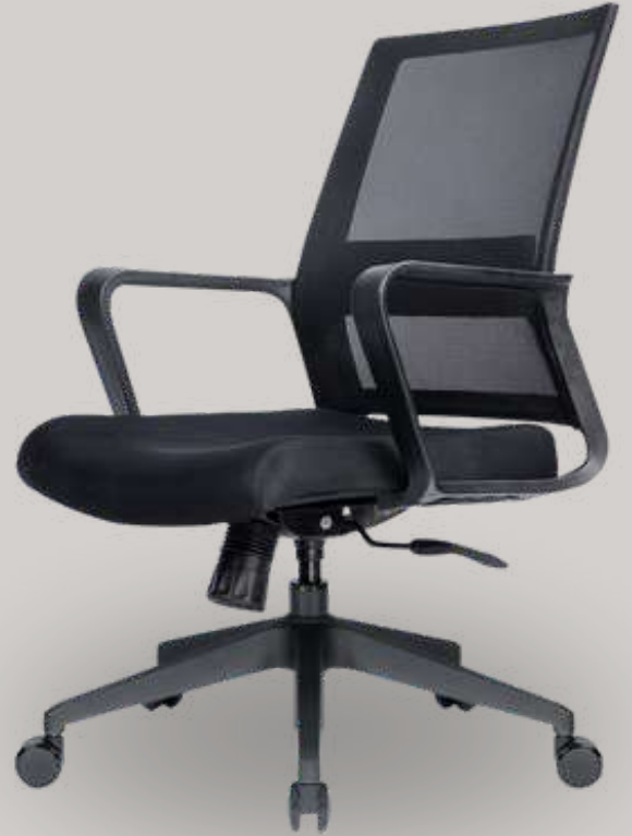
PUNCH M9 : 6050/-