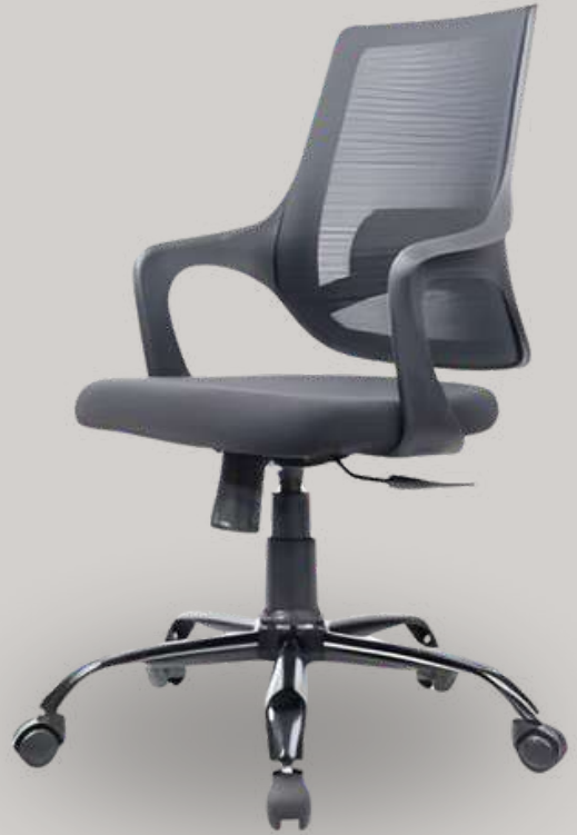
ROMA : 6050/-