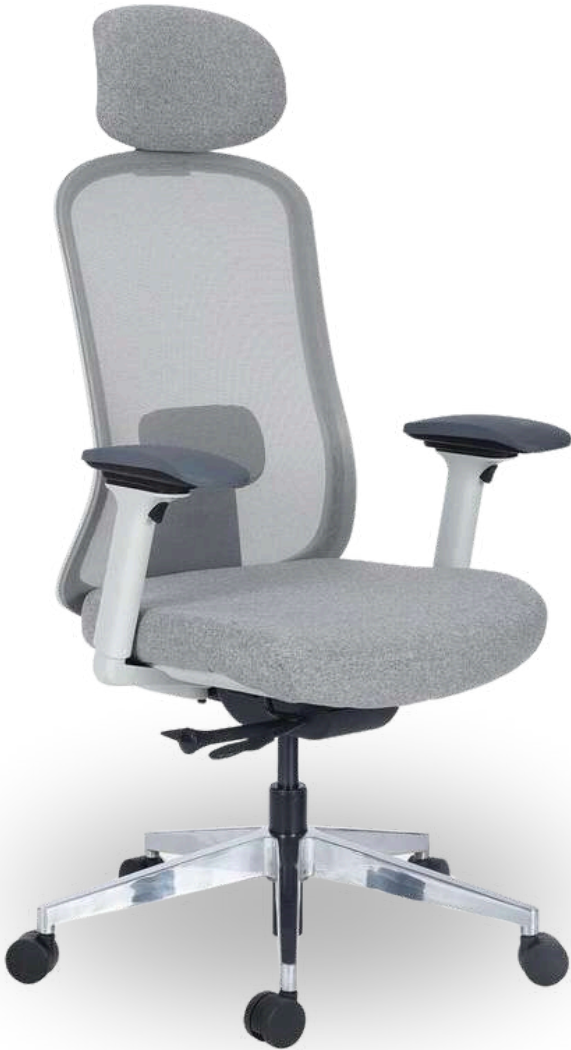
ACE MAX HB : 14300/- MB : 13200/-