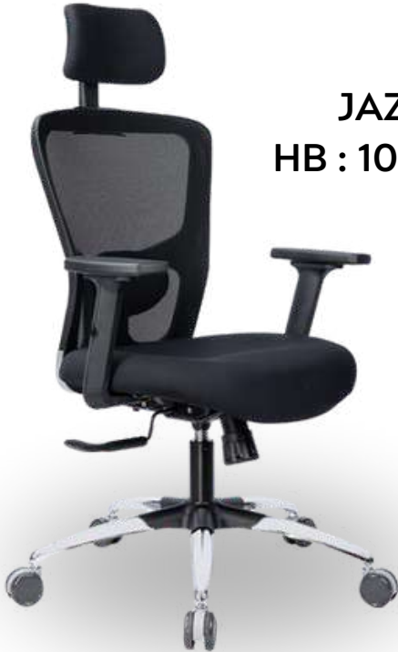
JAZZ HB : 10000/-