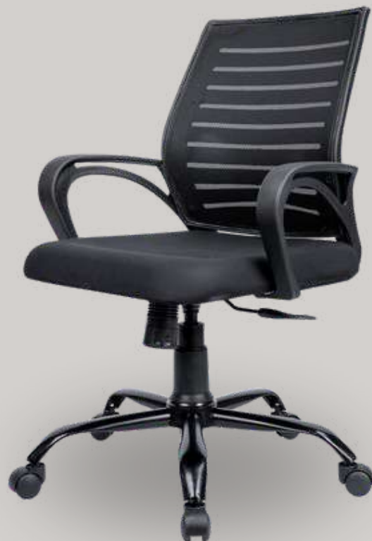
BOOM : 6050/-