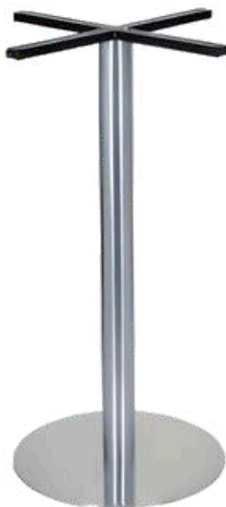
E-18 : Bar table base : 8250/-