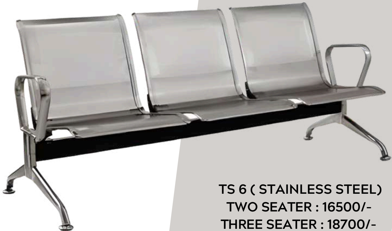
TS 6 ( STAINLESS STEEL) TWO SEATER : 16500/- THREE SEATER : 18700/-