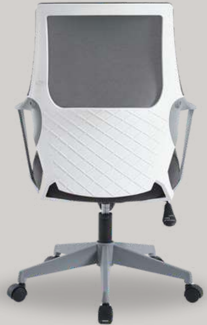
M33 GREY : 7700/-