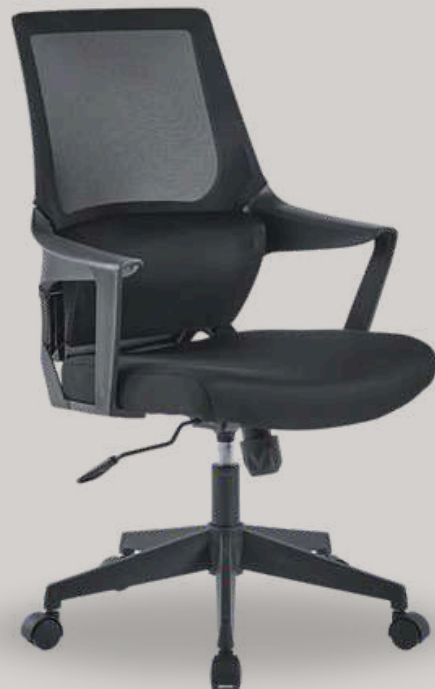
M33 BLACK : 7150/-