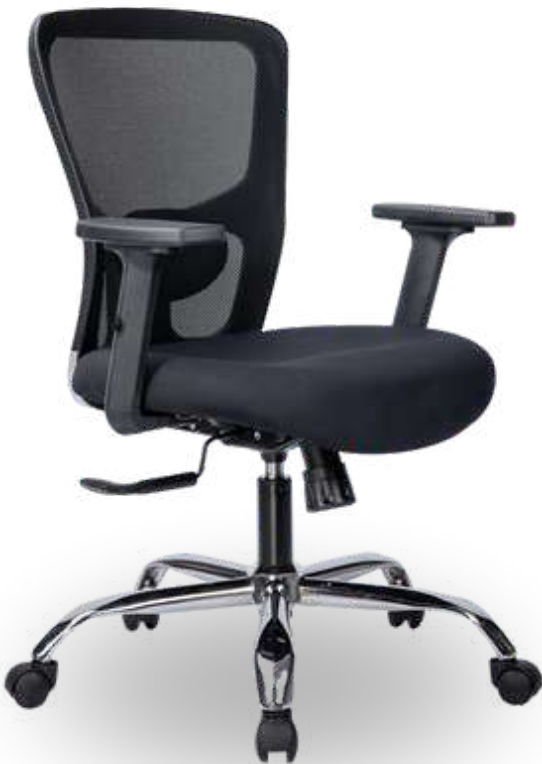
JAZZ MB MB : 8800/-