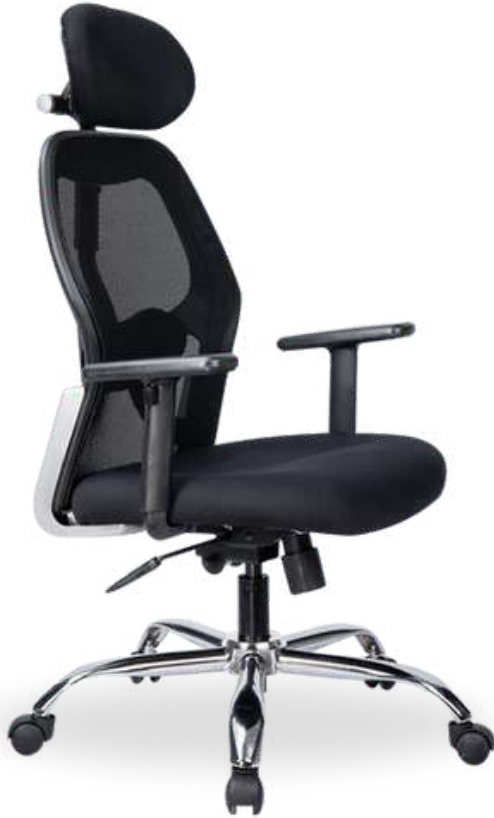
MATRIX HB : 9500/-