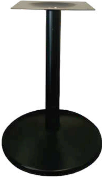
PC Round table base : 4000/- Height : 720mm