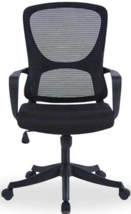
M32 BLACK : 6600/-