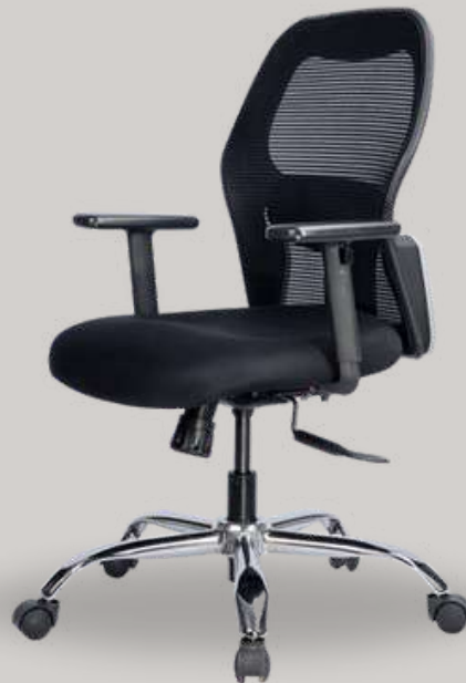
MARVELLA MB : 8800/-