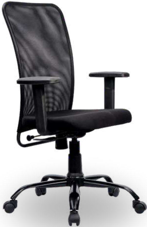
AIRCON : 6050/-