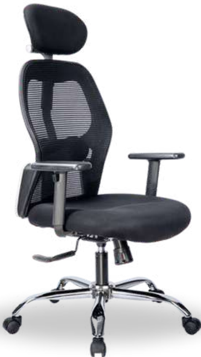
MARVELLA HB : 9500/-