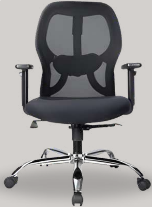
MATRIX MB MB : 8800/-