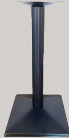
PC Square table base : 4000/- Height : 720mm