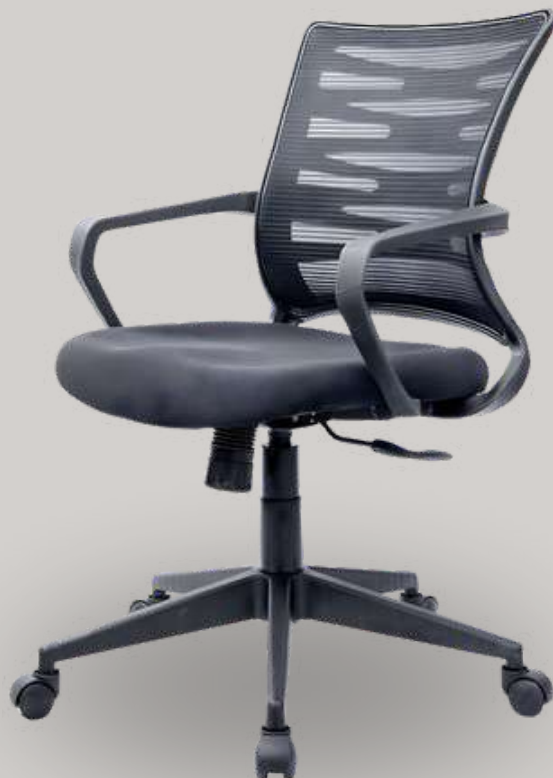
KABEL : 6050/-