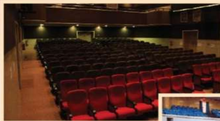
= AUDITORIUM - 01