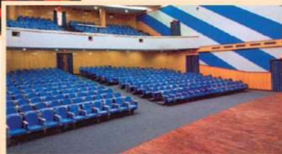
= AUDITORIUM- 02